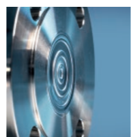
Chemical seal mounting