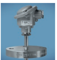
Electrical temperature measurement