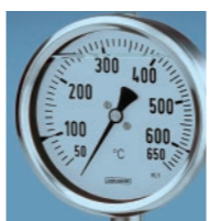
Mechanical temperature measurement