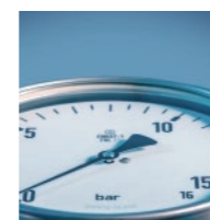
Mechanical pressure measurement