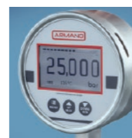
Electronic pressure measurement