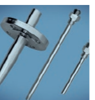
Thermowells & Accessories