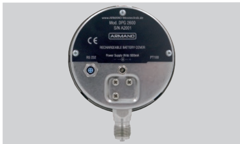
Figure 1: nameplate

The nameplate is located on the device. It contains the most important technical data and information.